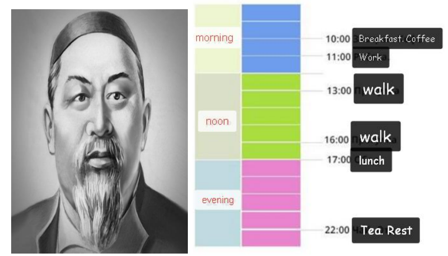
Figure 3. Example of using multimodal texts (infographics).

Abai Kunanbayev is a famous Kazakh poet, philosopher, musician, people's educator. His works are known all over the world. In the morning at 10 o'clock Kunanbayev usually has breakfast. Then he works. In the afternoon at 4 o'clock he walks. The poet dines in the evening, at 5 o'clock. He rests at 10.