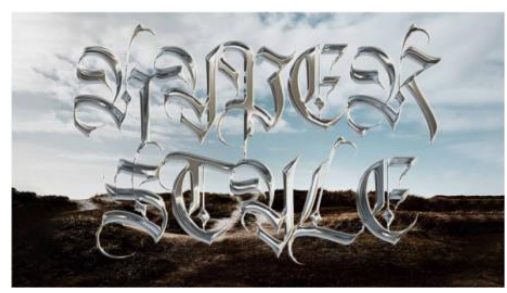
Сур.1 сұйық металл және хром дизайнда қолдану

Сұйық «сынап» қаріптері. Екі жылдық карантиннен кейін барлығына шығармашылық өмірдің жаңа тарауының жақындағанын сезіну үшін жаңа нәрсе қажет болды. Сұйық металл мен хром типографиясының 3D дизайны мен тренді пайда болды. Бұл стильде көптеген дизайн тұжырымдамалары тоғысады: 2000-шы жылдардағы стильді өмірге қайтару арқылы дизайнерлер адамзатқа аздап оптимизм мен жарқын болашаққа деген сенімділікті оятуға тырысады. 3D өнері шабытты оятатын таңқаларлық, эмоционалды формалары үшін жақсы көреді.Ал балқитын металл текстуралар үлкен магнит сияқты жұмыс істейді, өйткені оларды мәңгілікке қарауға болады. Биылғы жылы түсінікті қаріптер басымдыққа ие болса да, эксперименттік типографияның орны әлі де бар.