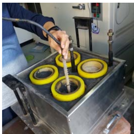
Figure 5. Prepare soil in samples for freezing test.

In this experiment, the specimens were weighed at 100% degree of compaction using the maximum drying unit weight and the optimum water content, in the soil compaction test method.