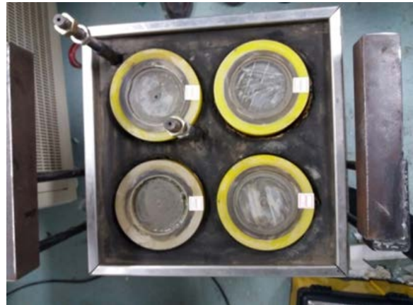
Figure 2. Four samples in freezing box.

The sensors of the decal and thermocouple were connected to the data logger automatic measuring equipment. In addition, the TDR probe floating water was measured by connecting to a laptop and measured by a measuring program. All the data were measured at intervals of 1 hour (Figure 4).