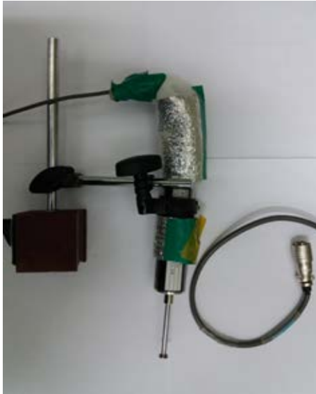
Figure 1. LVDT for measuring the swelling amount.

(TDR), was installed inside the specimen. The temperature of each specimen was measured using a thermocouple installed at 1 cm intervals. LVDT (Figure 1) check settlement soil in the samples [18-20].