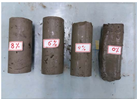
Figure 6. Results freezing test of different type of clay samples.

When water is present in the bottom soil at a temperature below 0 °C, the water rises along the surface of the soil constantly due to the capillary phenomenon, and flows into the upper part to cause frostbite. In stationary frost heaving, the freezing of pore water gradually increases and the amount of in-phase expansion increases with the increase of ice crystals in the sample. The formation of the pieces was remarkable, and the enlargement of the area of the ice lens portion could be confirmed by the naked eye. However, CL, which are not susceptible to frostbite, are very small in shape and cannot be visually confirmed [2-10]. The figure 6 are illustrated different type of samples. So, much better physical characteristics is clay with chemical additives 8% has piece ice lens.