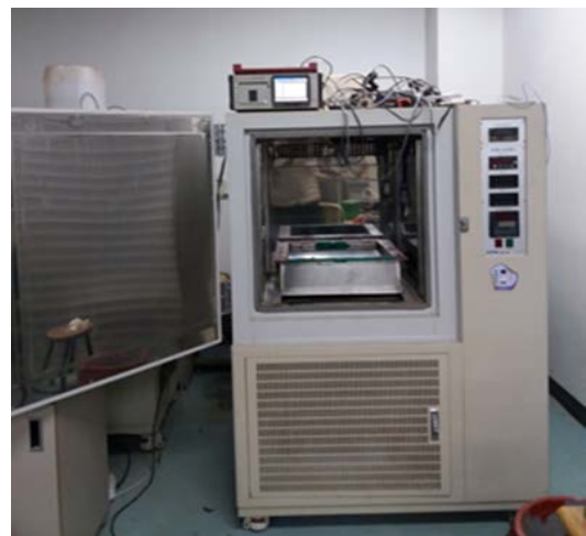
Figure 4. Freezing camera.