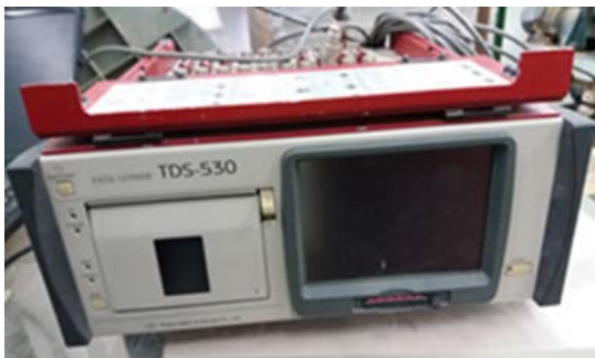
Figure 3. Monitor to check displacement freezing soil.

The sensors of the decal and thermocouple were connected to the data logger automatic measuring equipment. In addition, the TDR probe floating water was measured by connecting to a laptop and measured by a measuring program. All the data were measured at intervals of 1 hour (Figure 4).