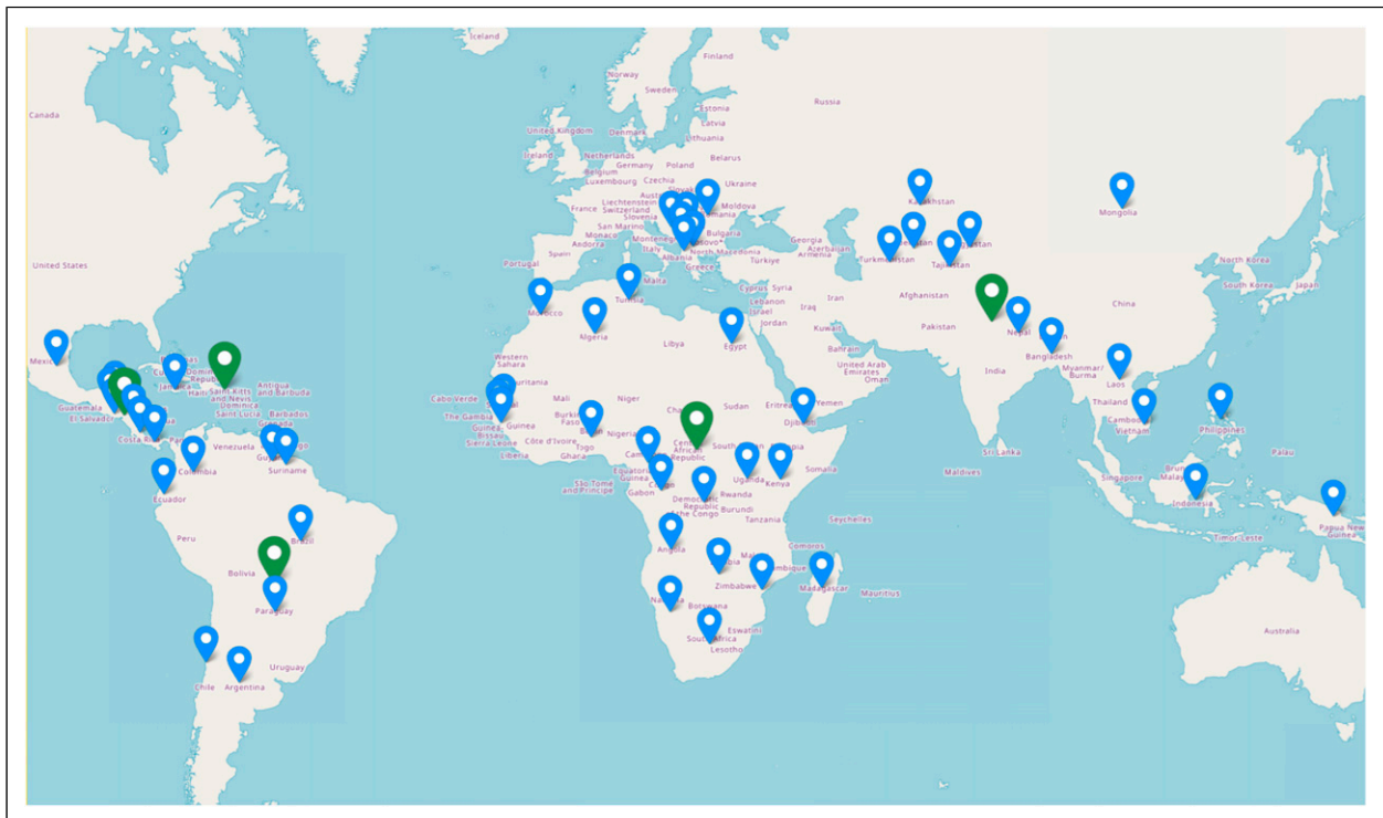
Figure 2. Global Gateway projects: green mark, regional initiatives; blue mark, country initiatives (European Commission 2023).

The program records a number of concepts indicating the opposition of the “Global Gateway” to China’s “One Belt, One Road” initiative. The key concept of the program is “strategic autonomy,” which states that “the EU must be able to do and say what it wants without being constrained by other powers.” It makes a point of systematically screening out “abnormally low tenders” and “foreign subsidies” that provide unequal conditions. It also proposed to explore the possibility of creating a European export credit fund to support European enterprises in order to facilitate their competition with firms backed by the Chinese government. Simultaneously it has been assumed that the EU attaches more importance to grants and concessional loans than “One Belt, One Road,” which requires significant loans. This nature of the program certainly demonstrates its advantages and makes it attractive to most countries (see Table 2). The president of the European Commission explained why developing countries would prefer to cooperate with Europe. “They know we are transparent. They know we will provide good cash flow management. They know that we will not allow the accumulation of unsustainable levels of deb.” Ursula von der Leyen said, “Local communities will benefit greatly from the added value of infrastructure investments. We will attract the private sector to work with us. And the right private sector does not exist in China. So this is a real alternative” (Liboreiro, 2021).