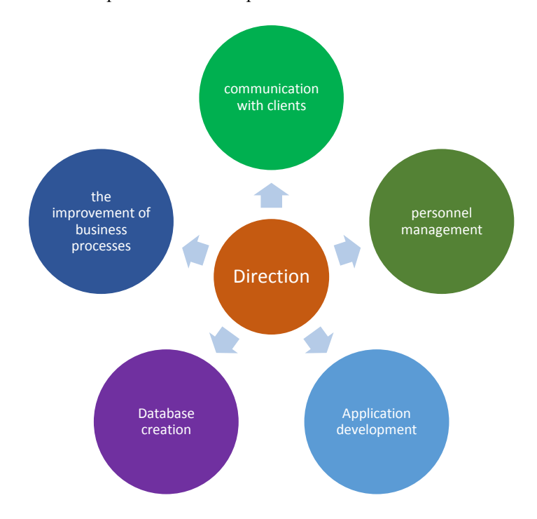
Fig. 2. System of main directions of application of digital technologies in the banking sector.