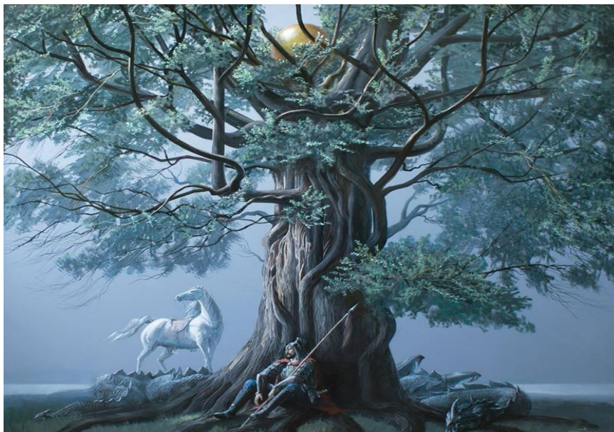
Figure 4. Aibek Begalin. "Bayterek". Oil on canvas. 100x120 cm, 2012.