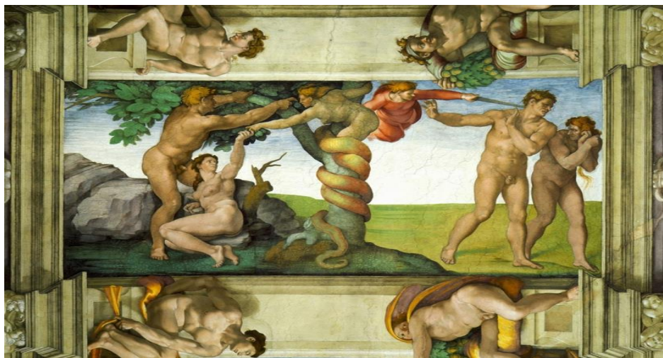
Figure 2. Michelangelo Buonarroti. "Don't be expelled from heaven". 280x570 cm.

The snake has an important place in the belief of the Kazakhs. The Cossacks attributed mysterious meanings and talismanic adjectives to the snake, but also thought it had the ability to help. In other words, the snake cult is one of the important branches of Kazakh mythology. What we call the serpent cult here is the perspective of the mythological culture of an ethnic and cultural environment towards the snake, and it has an important role in the traditions and ceremonies in the society in question. The important thing here is whether the snake is shown in a positive sense or as a symbol of evil, and that is the point.