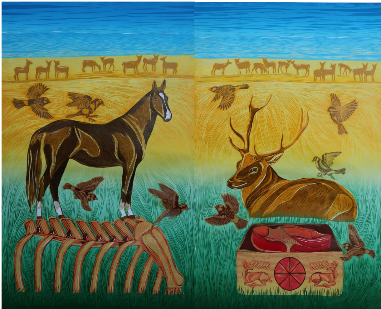
Figure 5: Karim Baigutov, "Soul", Wood Print, 125x166 cm, 2019

The painter depicted the moment after the hero killed the dragon in an oil painting education technique in a realistic way. In the middle of the work, there is a hero resting at the bottom of the "Bayterek" tree and a lifeless dragon lying around the tree. In the background behind the Bayterek tree, a white horse with its head turned is depicted. If we look at this, the horse feels that the Samruk bird is flying. What needs to be noted here is the golden egg-shaped object on the top of the Bayterek tree. There is a common point between the artistic work of artist Aybek Begalin called "Bayterek" and our "Bayterek" work made with wood printing technique. It is the treasure at the top of the Bayterek tree. According to the myth, if this treasure is destroyed, the road to the ground will be closed.