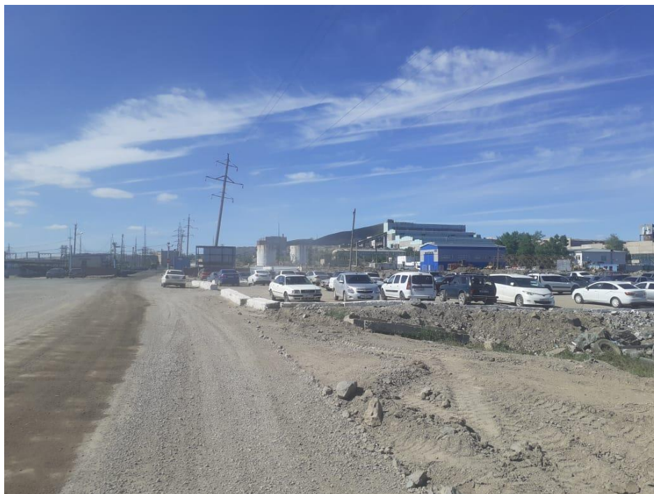
Figure 3. Karagaily Mining and Processing Plant of “Karagandatsvetmet” PA, a branch of Kazakhmys Corporation LLP

According to the draft regulations for maximum allowable emissions (MAE) of pollutants into the atmosphere of the Karagaily Mining and Processing Plant for 2022-2031 (10), the total number of sources polluting the environment is 48 (29 stationary sources, and 19 fugitive sources). The previous Draft MAE considered sources in the amount of 46. The increase in the number of pollution sources is associated with the merger of two approved projects – DP “Reconstruction of the Karagaily Mining and Processing Plant for processing ores from the Akbastau, Abyz, Kosmurun deposits”. The reconstruction of the Karagaily Mining and Processing Plant considered emissions from 46 pollution sources (the main operations of the concentrator). The Glavniy Pit operation project considered emissions from 2 pollution sources (dusts from the pit walls and beaches). Thus, when combining the above approved projects, 48 sources are obtained, which are regulated by this Draft MAE for 2022-2031. Other additional sources of pollutant emissions are not considered in the developed Draft MAE.