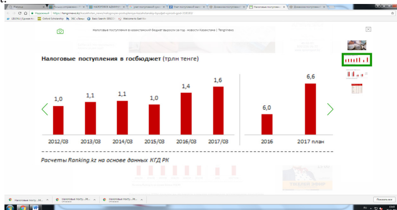
Figure 1. Tax revenues for the state budget (trillion tenge)

Taxes in the amount of 1.6 trillion tenge were collected in the republican budget for the first quarter of 2017 in Kazakhstan. (Figure 1) Tax revenues for the state budget for the current period increased by 14 %. This year, tax revenues will increase by 600 billion tenge, or by 10 % compared to the previous period, amounting to 6.6 trillion tenge according to the plan. 72 % of them go to the republican budget and 28 % go to the local budget.