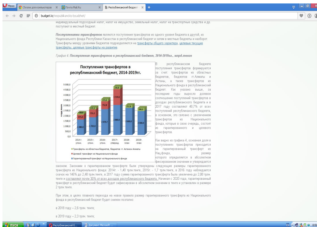
Figure 6. Receipts of transfers to the republican budget, 2014-2019, billion tenge Source: compiled by the authors on the basis of the official online resource of SRC of the RK data http://kgd.gov.kz/ru

As can be seen from Figure 6, the main share in the transfers is accounted for by a guaranteed transfer from the National Fund, the amount of which is determined in absolute fixed value and approved by the law of the Republic of Kazakhstan on the republican budget for three years. According to the Concept of Formation and Use of the National Fund of the Republic of Kazakhstan, the following amounts of the guaranteed transfer from the National Fund were approved: in 2014, - 1.48 trillion tenge, 2015 – 1.7 trillion tenge, in 2016 – 2.48 trillion tenge, which is 146% more than in the previous year, in 2017 the amount of the guaranteed transfer was increased up to 2.88 trillion tenge and make almost 30% of all revenues of the republican budget. [5], [6], [7]. The active use of the funds of the National Fund of the Republic of Kazakhstan is also associated with the transition to a floating exchange rate of the national currency – tenge, as well as with the fall of global oil prices. Starting from 2020, the amount of the guaranteed transfer to the republican budget will be fixed in absolute value in tenge and set at 2 trillion tenge, which corresponds to the policy.