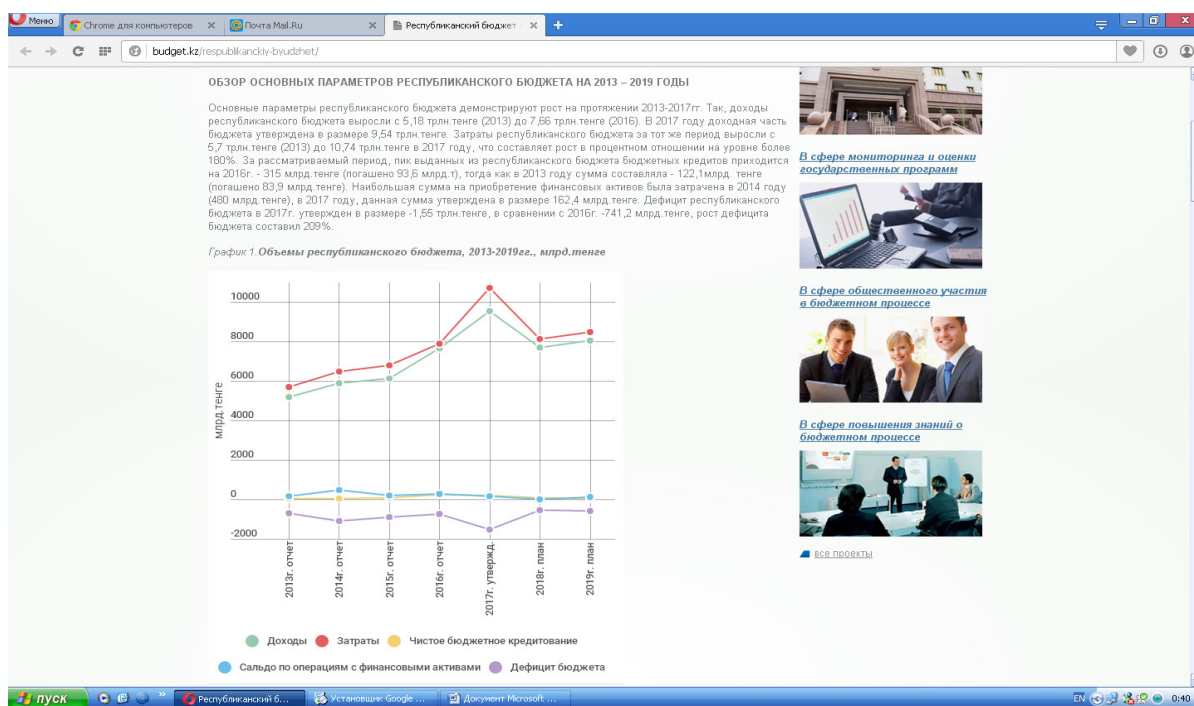
Figure 2. The main parameters of the republican budget for 2013-2019, billion tenge

The main parameters of the republican budget show growth over the period 2013-2017. Thus, the revenues of the republican budget grew from 5.18 trillion tenge in 2013 up to 7.66 trillion tenge in 2016. In 2017, the revenue was approved in the amount of 9.54 trillion tenge. Expenses of the republican budget for the same period increased from 5.7 trillion tenge (2013) up to 10.74 trillion tenge in 2017 or for 180%. For the period under review, the peak of the public budget loans issued from the republican budget falls on 2016 – 315 billion tenge (only 93.6 billion tenge were paid off), whereas in 2013 the amount of public budget loans was 122.1 billion tenge (83.9 billion tenge was repaid). There is no transition to the main parameters of the budget! The largest amount for the acquisition of financial assets was spent in 2014 (480 billion tenge), in 2017, this amount was approved in the amount of 162.4 billion tenge. The deficit of the republican budget in 2017 was approved in the amount of 1.55 trillion tenge, compared with 741.2 billion tenge in 2016, the growth of the budget deficit was 209%. (Figure 2)