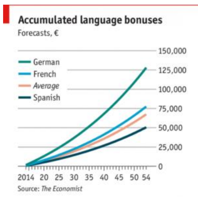
Figure 1. Language bonuses

Knowledge of a second foreign language, such as Spanish, French, or Chinese, for example, clearly demonstrates to the employer the value that a potential employee can bring to the company in the future. It is also possible to get several bonuses if a person speaks "related languages", that is, from the same language group. For example: Chinese and Japanese or German, English, French. Given all the above, it is advisable to name specific reasons why knowledge of a foreign language really affects career opportunities [5].