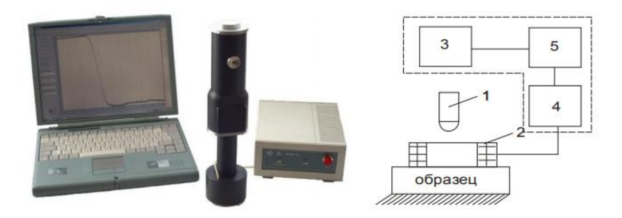
Figure 2. IPM-1A device and its structural diagram

Device IPM-1A (Fig. 2), the main element of which is an indenter – 1, which produces a test shock on a controlled coating (sample); magneto indication sensor-2, an indenter acceleration mechanism-3; analog-to-digital signal conversion (ADP) device connected to a personal computer-4.using the method of Non-Destructive Testing, the device IPM-1a allows you to determine the physical and mechanical properties of the material being tested: hardness, hardness, according to GOST 22690-2015 dynamic modulus of strength, elasticity.