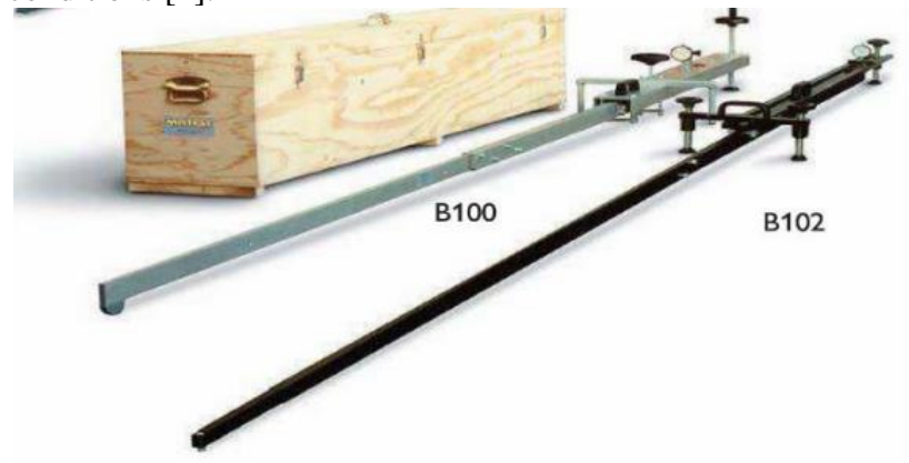
Figure 3. Benkelman's hammer

equipment used. The disadvantages are the duration of the study (1-1.5 hours per 1 km), depending on the weather conditions [4].